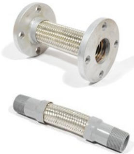
Keflex Braided Hose Assemblies

From standard pipe sizes, end connections, and lengths to complex value added assemblies (check out the Application Spotlight), Keflex has you covered when it comes to braided hose assemblies. The Gold and Gold Plus series are made in Woodstock, IL and meet ARRA requirements. For those customers with tight budgets, the Silver Series is our most economical offering and comes in standard sizes only. If you need a hose assembly for intermittent flexing or just a static bend don't worry, we have those too. The factory is ready to meet your lead time needs too, contact Stephanie for those quick turnaround requirements.