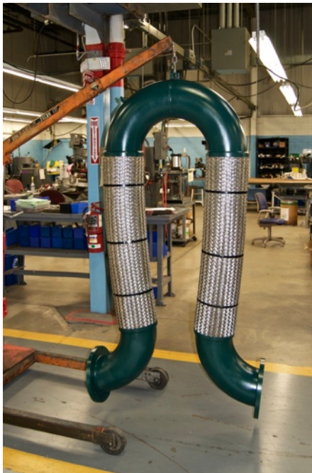
6” Keflex Ke-Loop U-Loop